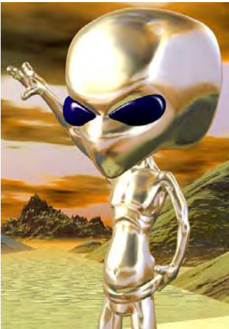
He might be Buddha but we bet Larry never looks like the alien pictured above.

Finally, the wallet-sized version of the tenets on the final page can be folded along the dotted line. A nifty laminated version is available at www.onetruelarry.org . 57