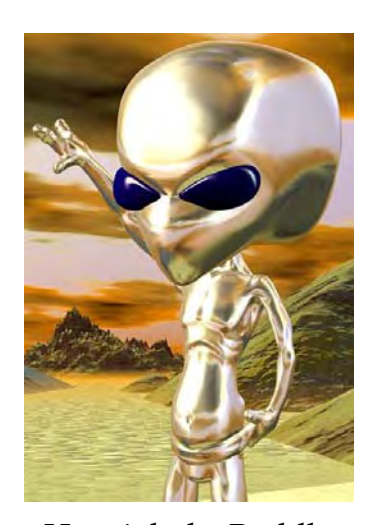
He might be Buddha but we bet Larry never looks like the alien pictured above.

Finally, the wallet-sized version of the tenets on the final page can be folded along the dotted line. A nifty laminated version is available at <a href="https://www.onetruelarry.org.57">www.onetruelarry.org.57</a>