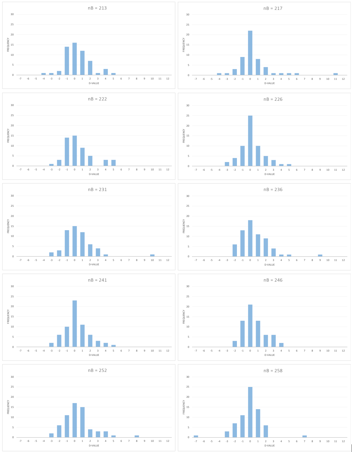
Figure 2: Distribution of D_k for our suite of experiments.